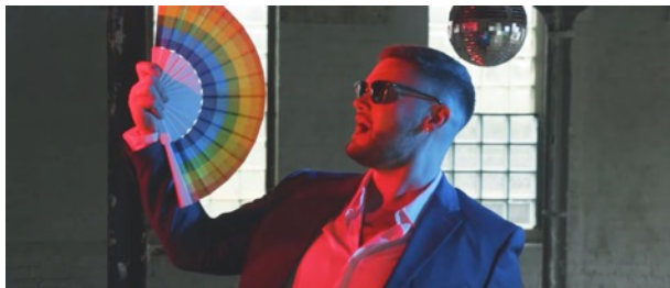
Hallelujah I Love Him So Ray Charles