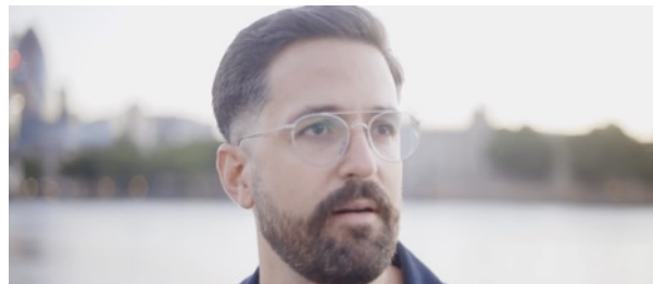
Blackbird/I Will The Beatles