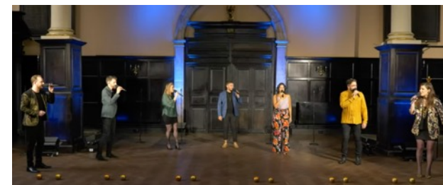
Badinerie Johann Sebastian Bach