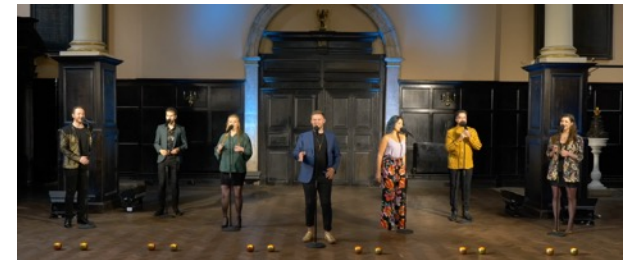
Live from London 2020 Highlights