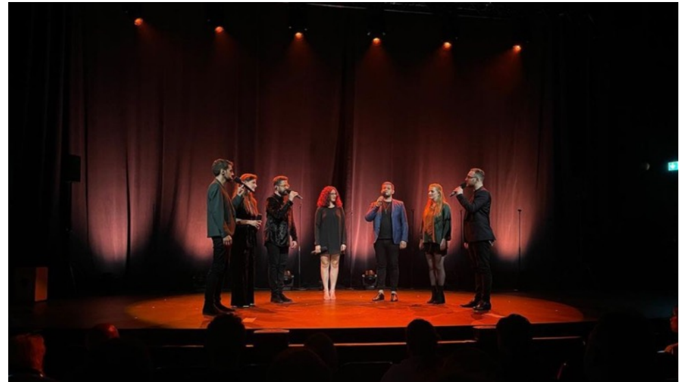
The Real Group Festival, August 2022

“Without question one of the best close harmony groups in the world... fantastic singers” GARETH MALONE OBE