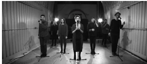
15 Step Radiohead