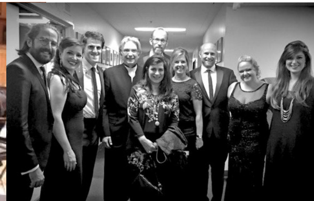
With Michael Tilson Thomas