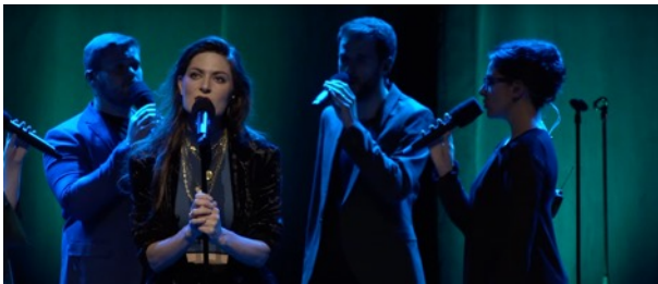
The Real Group Festival 2022