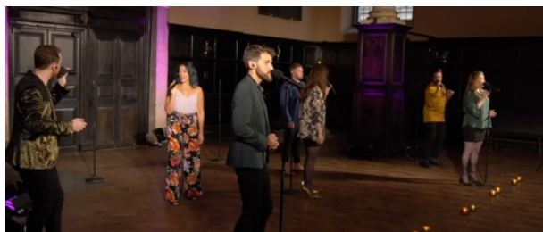
Bučimiš Bulgarian Traditional