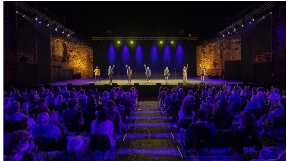
Ravenna Festival, June 2021