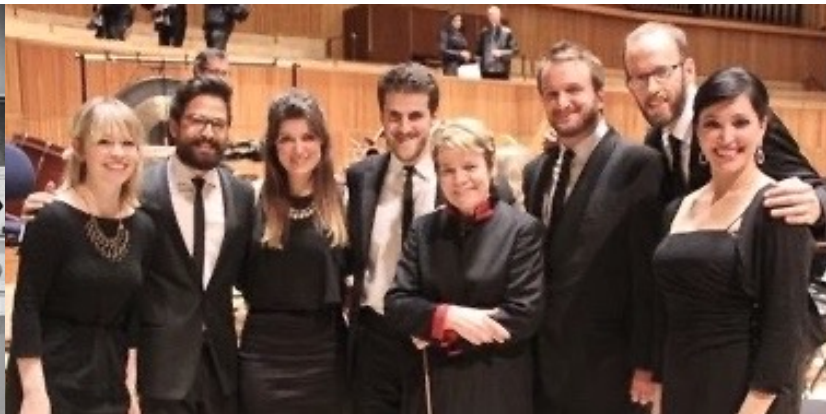
With Marin Alsop